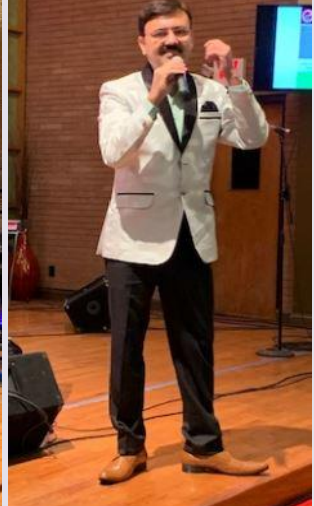
Grand Gala Annual Gathering Dinner with Bollywood Musical Group from India