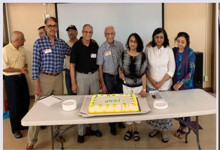
Birthday / Anniversary Celebration