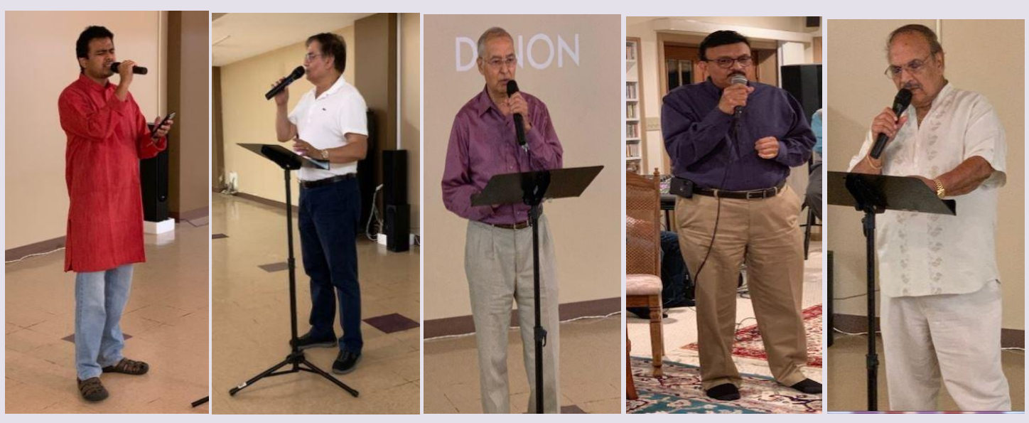
Melodious singers of USAP Karaoke Group